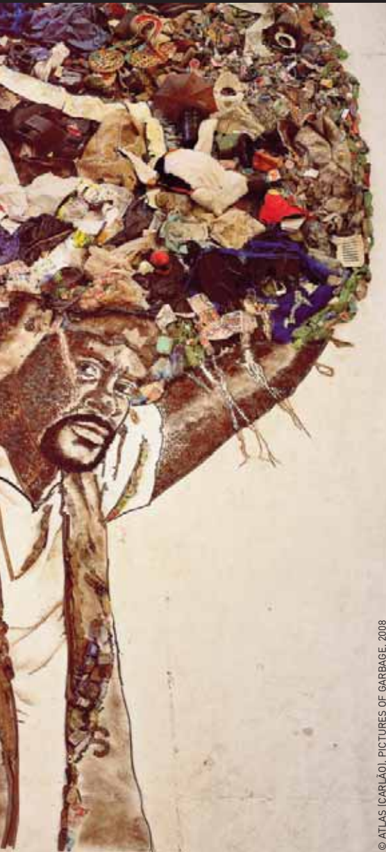
© ATLAS (CARLÃO), PICTURES OF GARBAGE, 2008