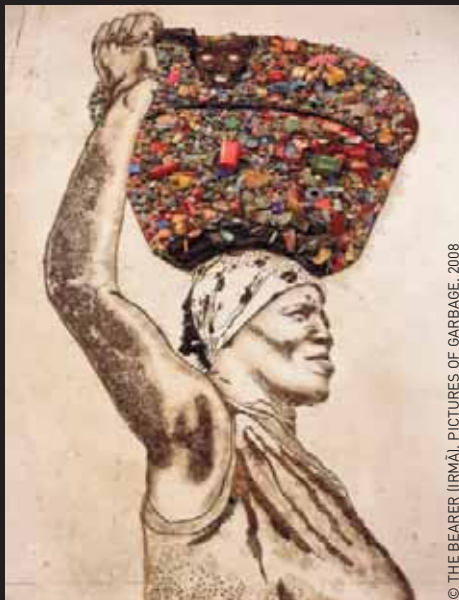
© THE BEARER (IRWÁ), PICTURES OF GARBAGE, 2008

Born in 1961 in São Paulo, Vik Muniz splits his time between Brazil and New York. For this artist - who describes himself as self-taught - and who grew up in poverty, drawing and images have always been an important means of communication. He began his career in the 1980s as a sculptor in New York, which in those days was a city boiling over with culture. But it was his series of photographs, entitled Pictures of Chocolate , that brought him worldwide recognition in 1997. What sets him apart is his ability to turn any material into a medium, and to use photography to capture the images he creates from materials ranging from the poorest to the most refined (sugar, chocolate, earth, ash, diamond, etc.). After painting the Mona Lisa with jam, Marilyn Monroe with ketchup and a wealth of other portraits, he now delves into the trash and turns what he finds into Art.